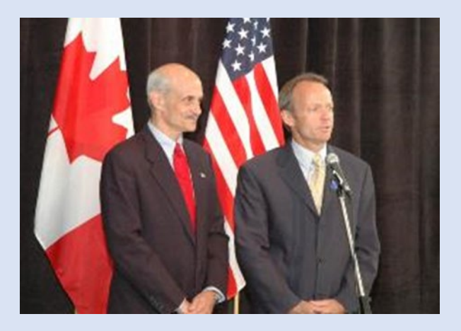
U.S. Secretary of Homeland Security Michael Chertoff and Minister of Public Safety Canada Stockwell Day at PNWER Summit in Edmonton 2006