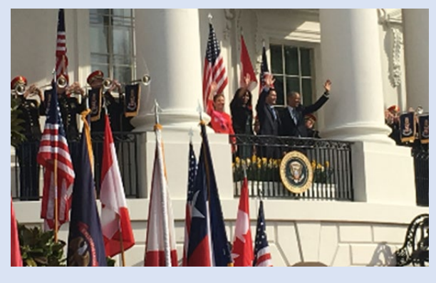
Canada Head of State visit to the White House