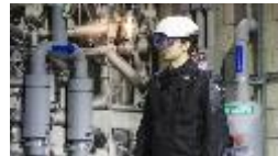
Daqri Industrial Helmet