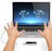
Leap Motion (Hand Tracking)