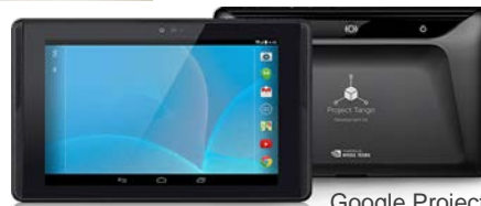
Google Project Tango