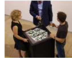
Lightfield Displays (Zebra Imaging, NVIDIA)