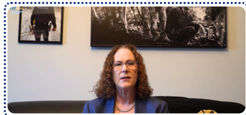
Congresswoman Hoyle provides updates on the bi-partisan surface transportation reauthorization legislation.