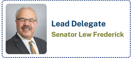
Lead Delegate Senator Lew Frederick

PNWER's mission is to increase the economic well-being and quality of life for all citizens of the region, while maintaining and enhancing our natural environment.