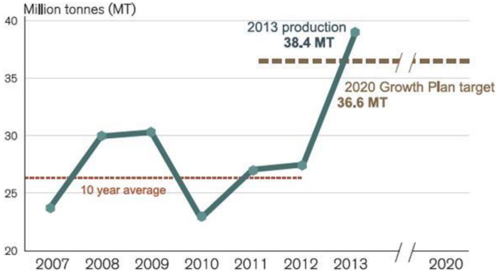
2013 Saskatchewan Crop Production