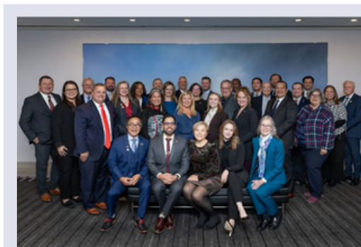
2024 LEHI Graduating Cohort at the Embassy of Canada to the U.S. in D.C.

Former ID Senate Pro Tempore Chuck Winder led a multi-year effort as PNWER President to focus the region to address key elements needed to ensure we have a secure energy future and food supply. This led to several meetings focused on interdependent sectors such as critical minerals, fuel and fertilizer which are all required to ensure we have required energy and food.