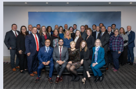
2024 LEHI Graduating Cohort at the Embassy of Canada to the U.S. in D.C.

Since 2009, more than 440 legislators from across the U.S. and Canada have graduated from PNWER's Legislative Energy Horizon Institute, which focuses on the North American energy infrastructure and delivery systems, covering energy generation, transmission, and distribution. Since the program's inception, 31 Alaska legislators have graduated from LEHI. PNWER provides full scholarships for PNWER legislators covering the cost of tuition, accommodations, and travel expenses totaling over $300,000 for Alaska.