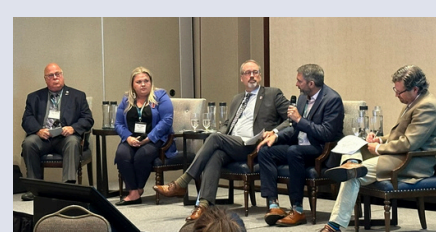
Arctic Caucus at the 2024 PNWER Annual Summit

The Arctic Caucus of the Pacific NorthWest Economic Region (PNWER) is a partnership between Alaska, Yukon, and the Northwest Territories. The partnership aims to provide a forum to share information, discuss issues of mutual concern, identify areas for collaboration between the three jurisdictions and the rest of North America, and provide Arctic-relevant input to PNWER working groups and the region at-large.