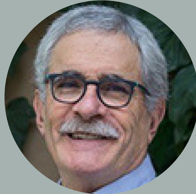
Senator Jeff Golden Oregon State Legislature