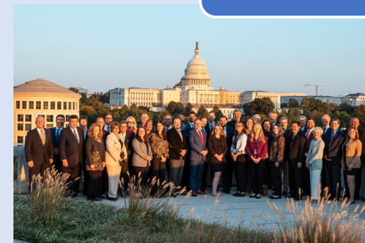
LEHI Cohort Graduation at the Canadian Embassy in 2023