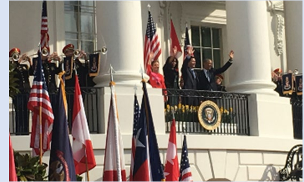
Canada Head of State visit to the White House