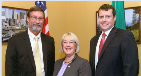
U.S. Sen. Patty Murray, WA meets with PNWER on Transportation Issues in 2015