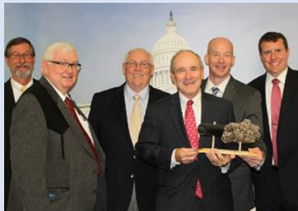
U.S. Sen. Jim Risch, ID with PNWER Delegation holding AIS infested pipe in 2015