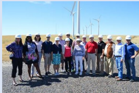
LEHI Cohort policy tour wind farm