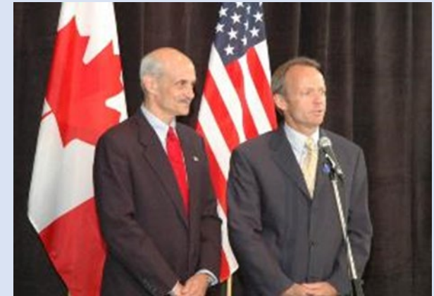
U.S. Secretary of Homeland Security Michael Chertoff and Minister of Public Safety Canada Stockwell Day at PNWER Summit in Edmonton 2006