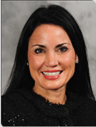
Sen. Lesil McGuire Alaska State Legislature