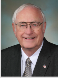
Sen. Jim Honeyford Washington State Legislature