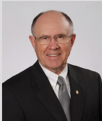
Sen. Chuck Winder Idaho State Legislature