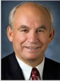
Hon. Bill Bennett Minister of Energy and Mines & Responsible for Core Review, British Columbia